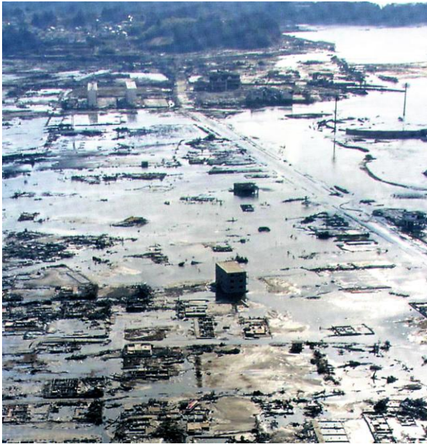
Fig. 2 Tsunami attacked Kesen-numa City (Tatakau Nihon, Sankei Shimbunsha, 2011)