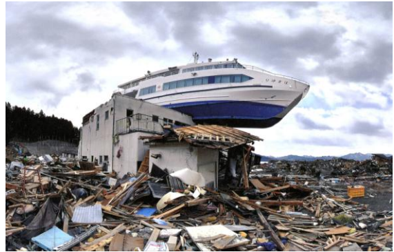
Fig. 3 Ship floated to the top of house (Tatakau Nihon, Sankei Shimbunsha, 2011)

The highest height of Tsunami wave was 15.8m in Rikuzenn-takada City and that of Fukushima No.1 Nuclear Power Plant was 14-15m. Total number of victims caused by Tsunami is not yet clear but it is estimated about 20,000. It was estimated nearly 30,000 in March but about 10,000 were found safe.